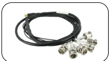
Trigger Out Cable