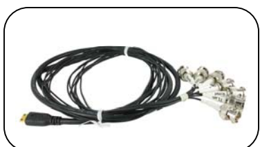
External DAQ Cable